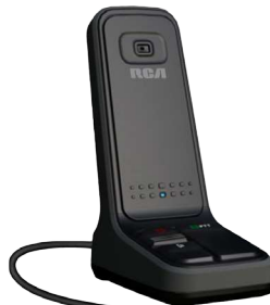
Desktop Microphone DMM1250