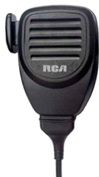
Speaker Microphone MM300D