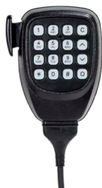
Keypad Speaker Microphone MM300DK