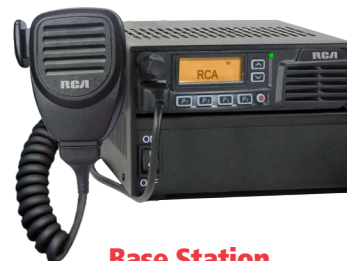
Base Station Conversion Kit BSC300D PKG